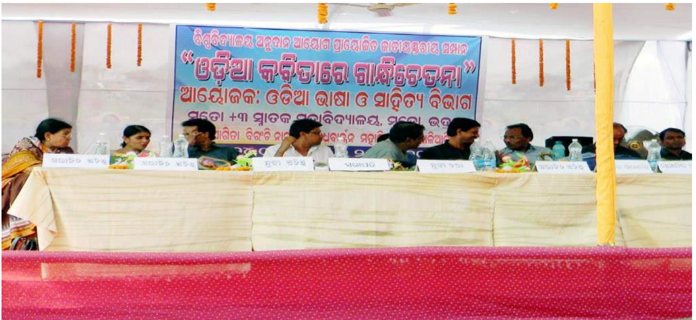
Innaguration of UGC National Seminar organised by the deptt. of Odia in 2013