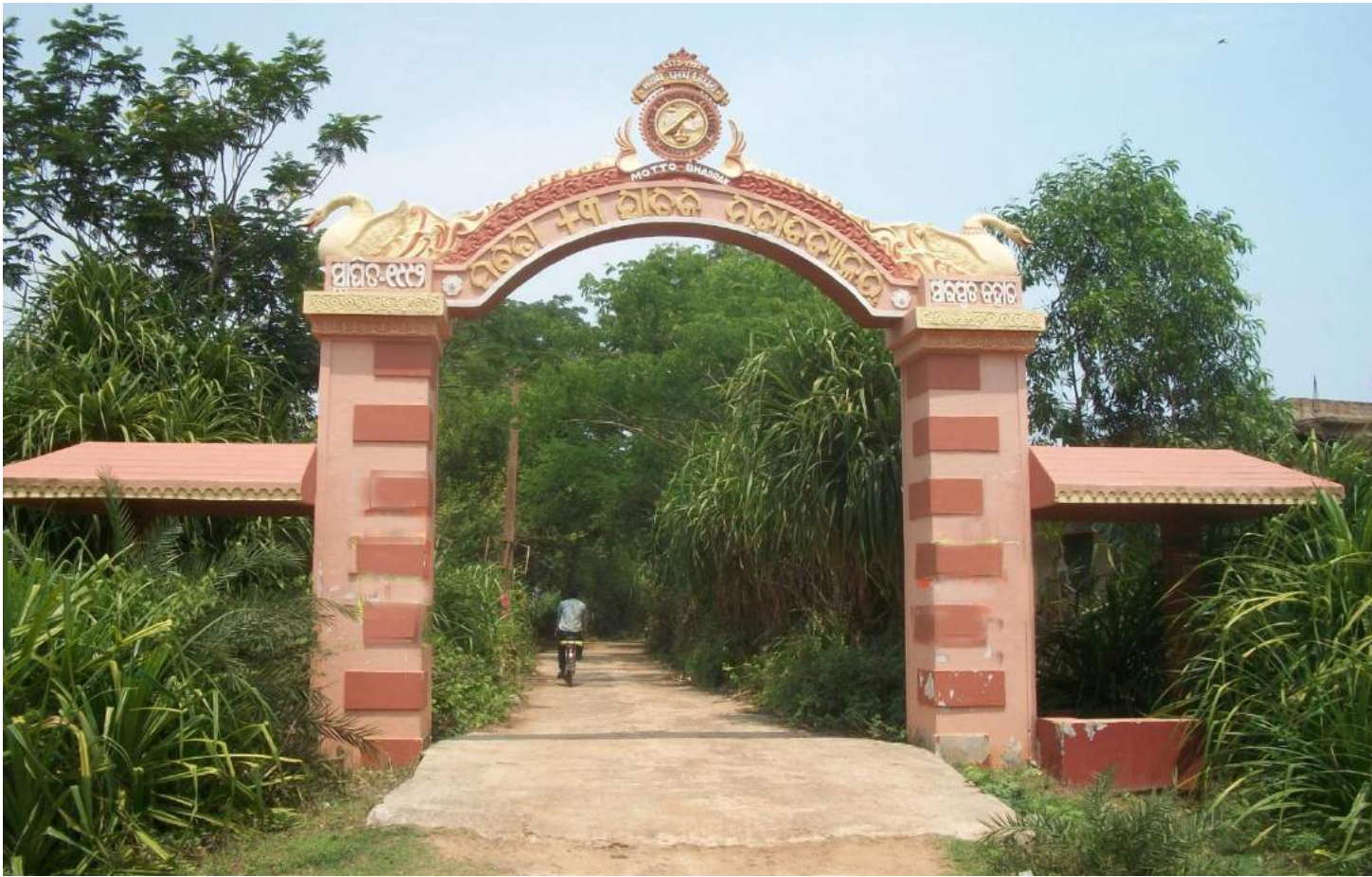
MAIN GATE OF MOTTO +3 DEGREE COLLEGE