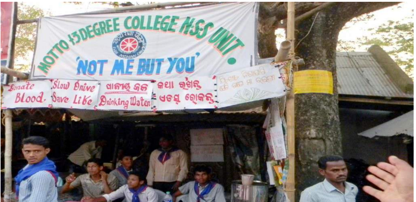
NSS Volunteers participated in normal camps organised on the occasion of Motto Melana