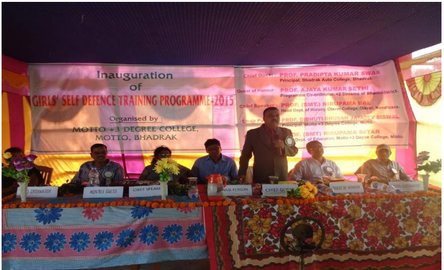
Inauguration of Girls' Self Defence Training Programme -2015