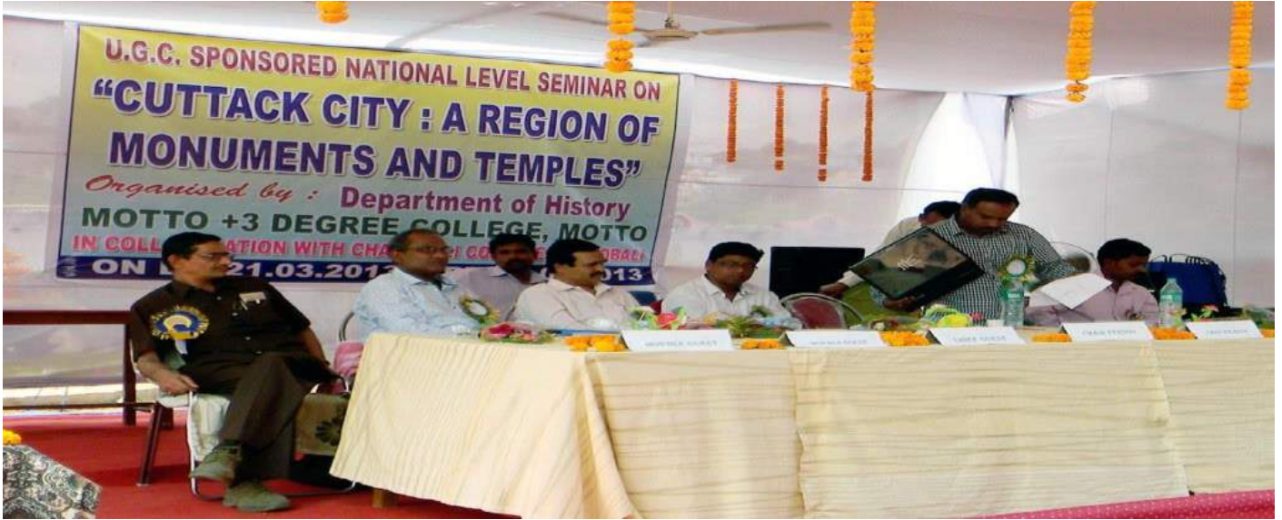
Innaguration of UGC National Seminar organised by the deptt. of History in 2013