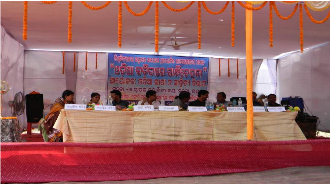
Inauguration of UGC National Seminar organised by the deptt. of Odia in 2013