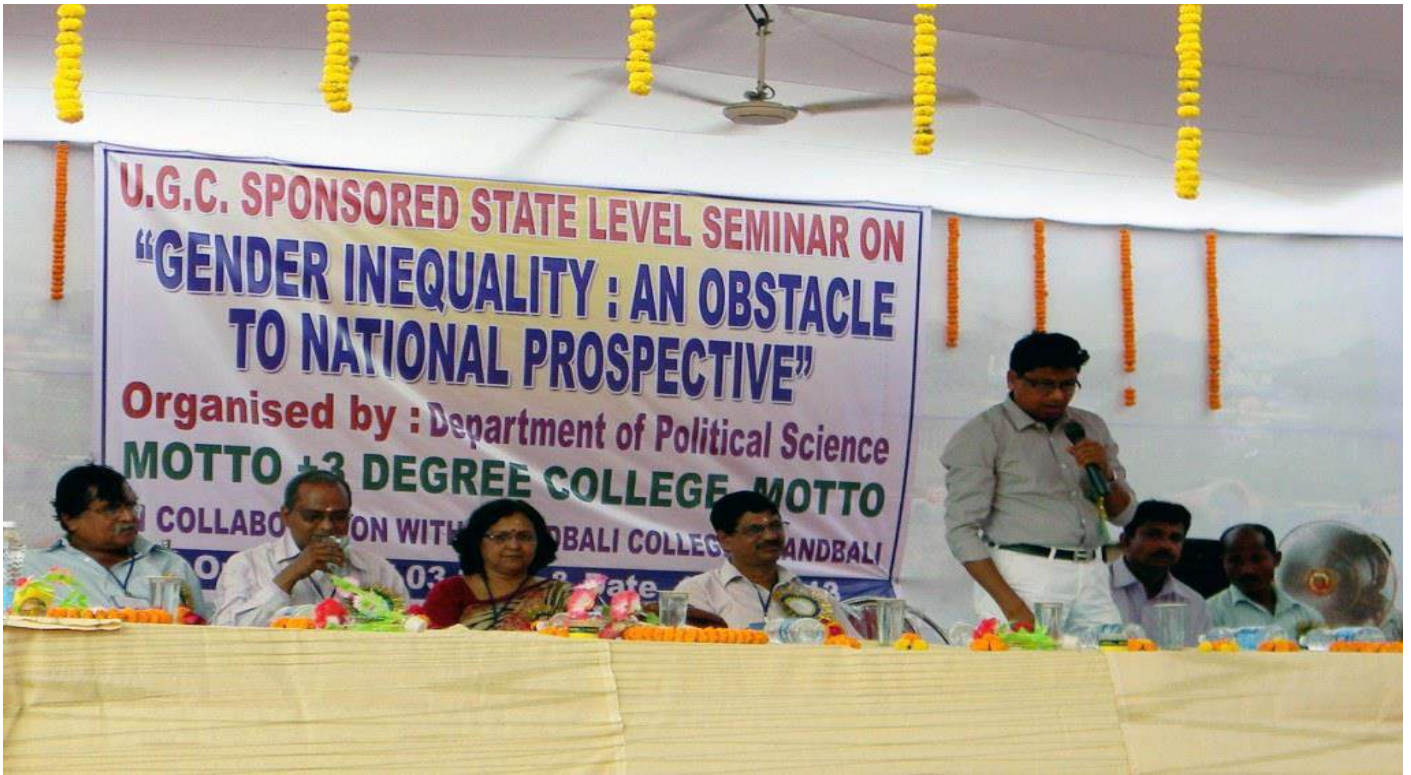
Innaguration of UGC State level Seminar organised by the depts. of Political Science in 2013