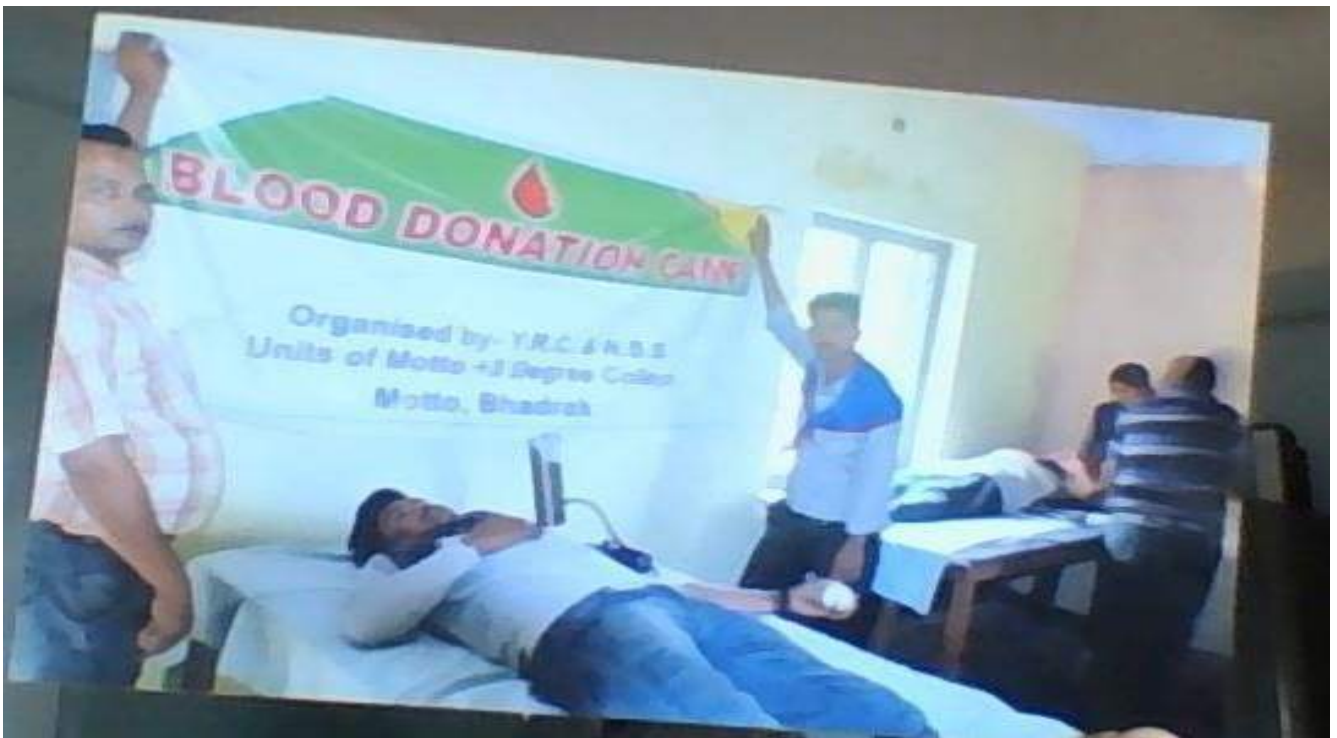
Blood Donation Camp organized by NSS & YRC Units