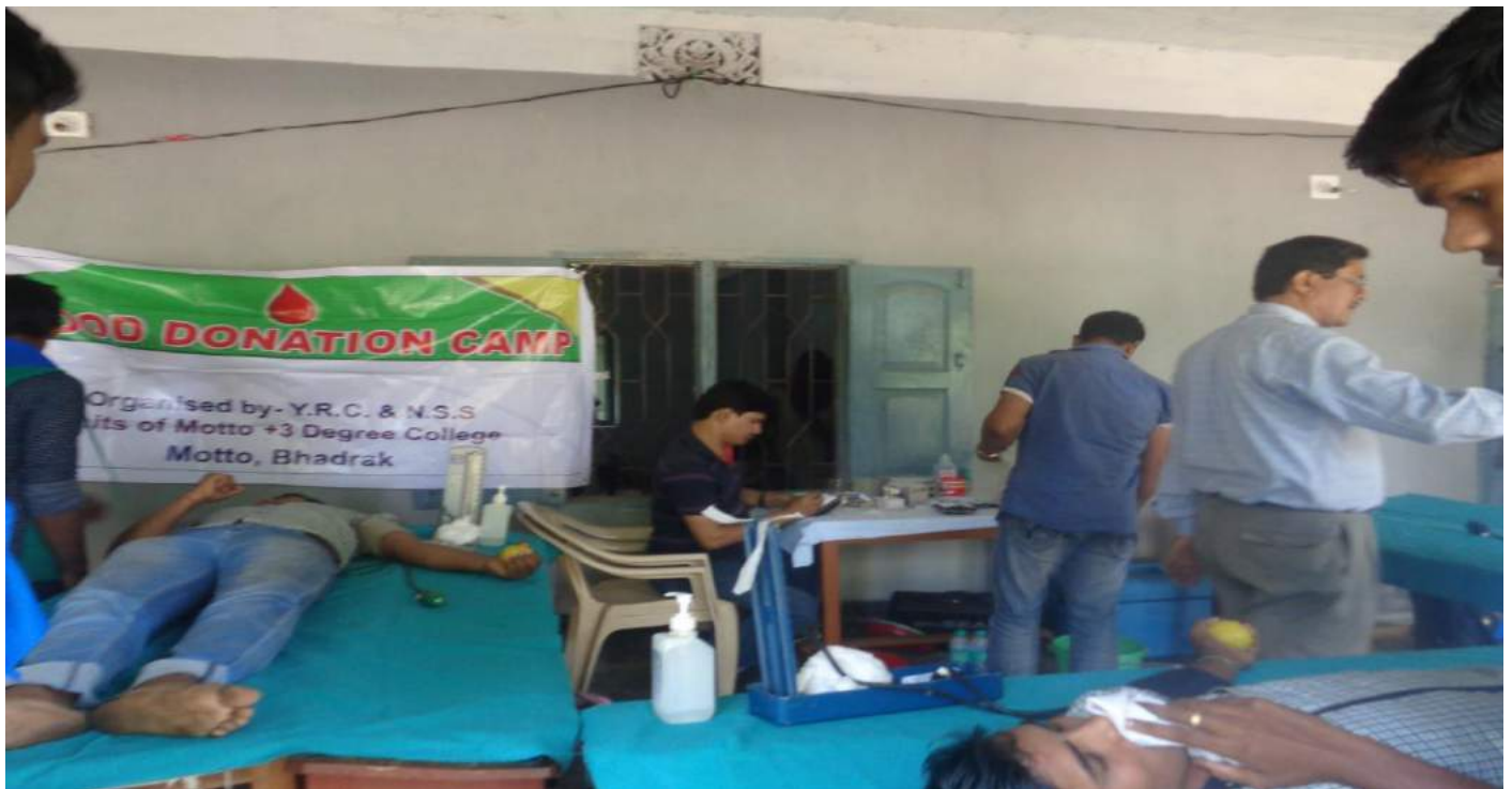
Blood Donation Camp.-2015 Organized by NSS & YRC Unit.