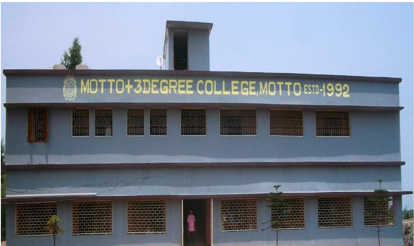
ADMINISTRATIVE BLOCK OF MOTTO +3 DEGREE COLLEGE