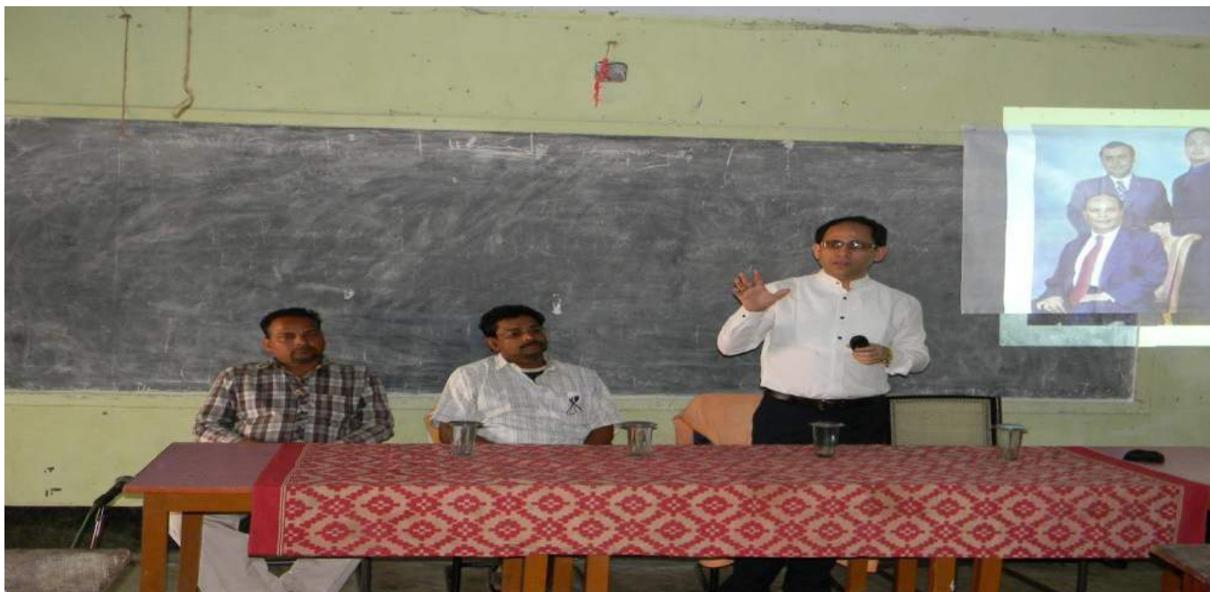
Health Awarness Programme organised by NSS & YRC Units of the college in-2014